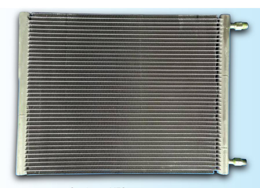
Condenser MFC 25mm